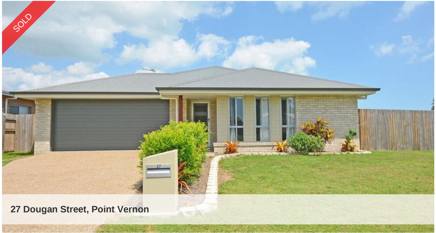
27 Dougan Street, Point Vernon