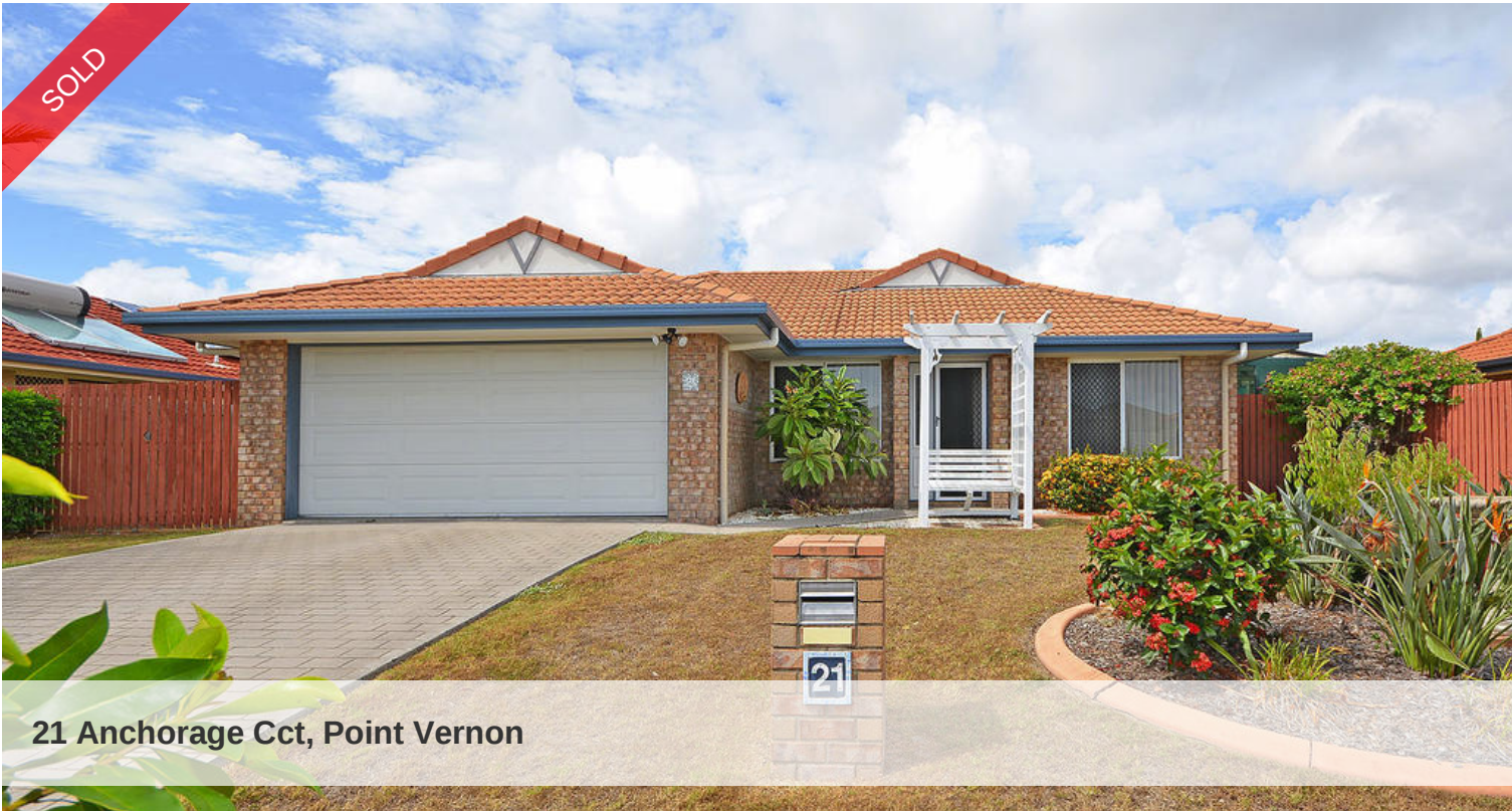
21 Anchorage Cct, Point Vernon