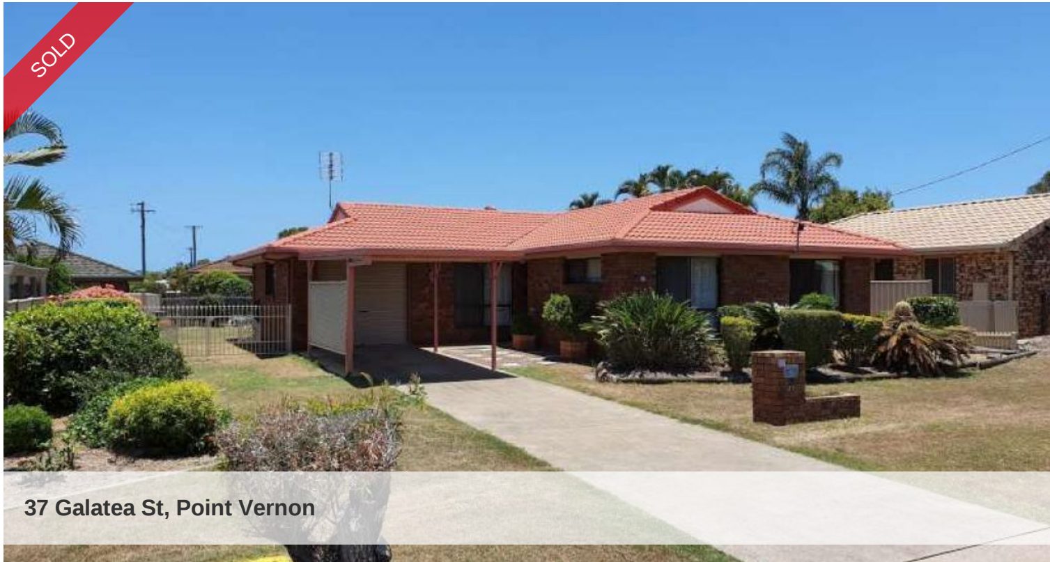
37 Galatea St, Point Vernon