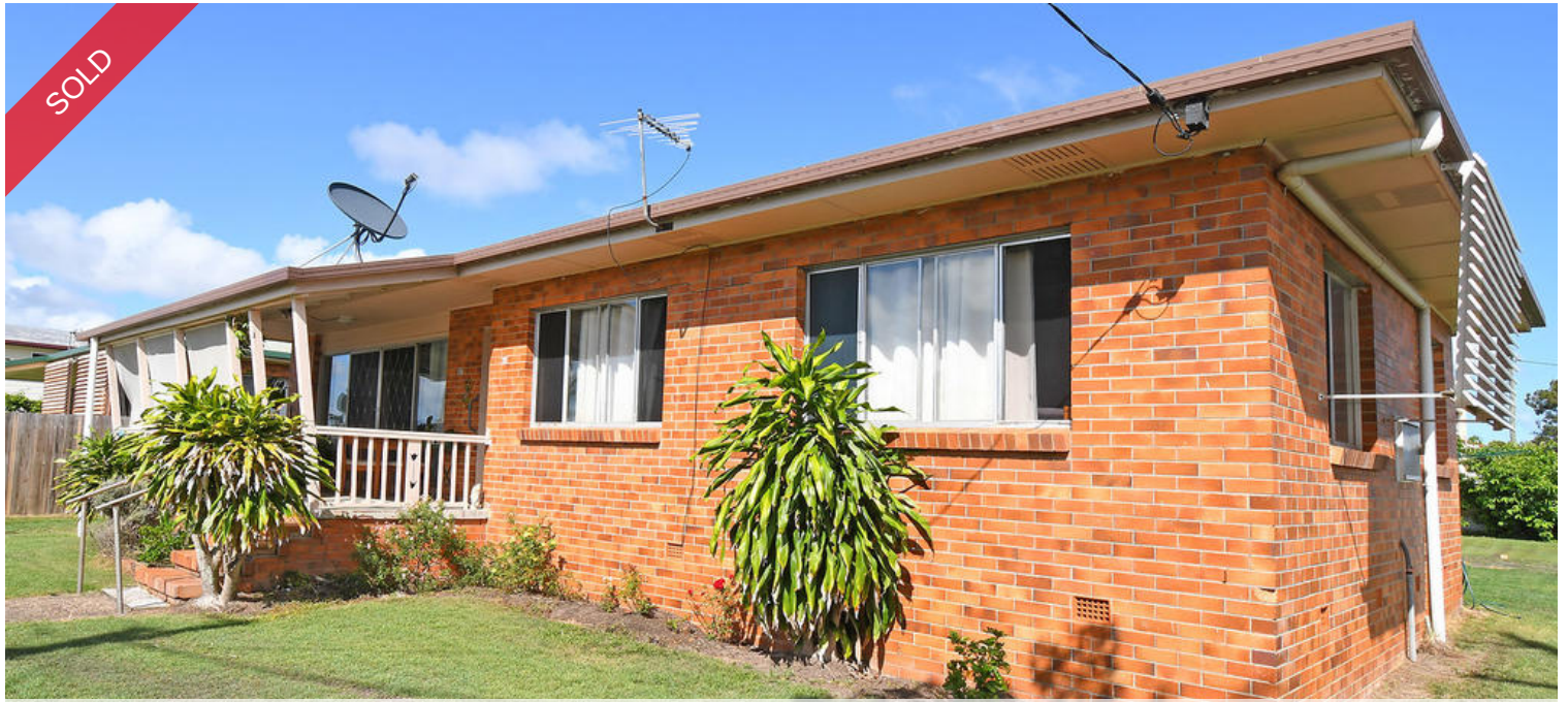
27 Drummond St, Urangan