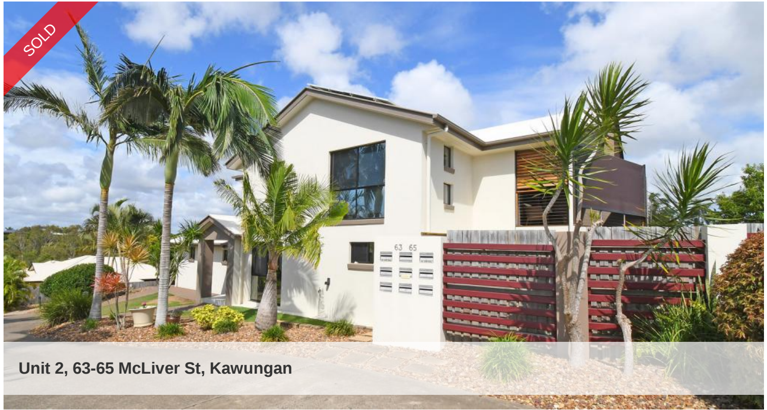
Unit 2, 63-65 McLiver St, Kawungan